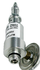
29 liter regulator